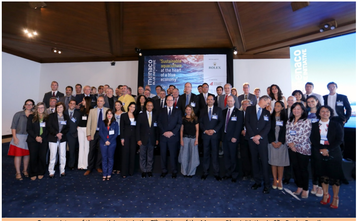
Group picture of the participants in the 7<sup>th</sup> edition of the Monaco Blue Initiative in São Paulo, Brazil.

sessions: 1) Sustainable aquaculture in South America: trends and challenges; 2) No waste, no pollution, more value: aquaculture in the circular economy; 3) Engaging consumers and stakeholders towards sustainability; and 4) Oceans' role in climate change.